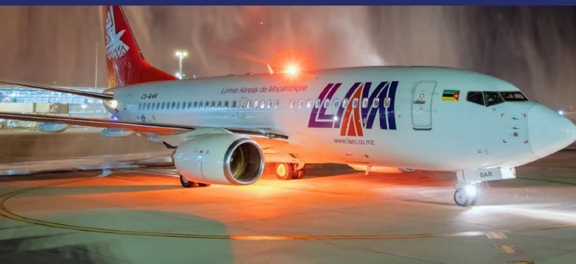
A customary water canon salute greets a LAM Mozambique Airlines' Boeing 737-800 at Cape Town International Airport.