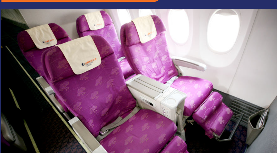
Shandong Airlines' fleet includes more than 100 modern aircraft. The Boeing 737-8 MAX is configured with eight seats in Business class (above) and 168 in Economy.