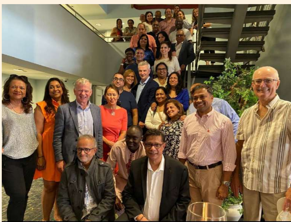
Here's to us! AirlinePros International's Board of Directors pictured (above) at the Intrepid Sea, Air & Space Museum in New York.

Blending strategic planning and team bonding, the recent AirlinePros International Board of Directors' meeting was followed by a get-together at the Intrepid Sea, Air & Space Museum in New York.