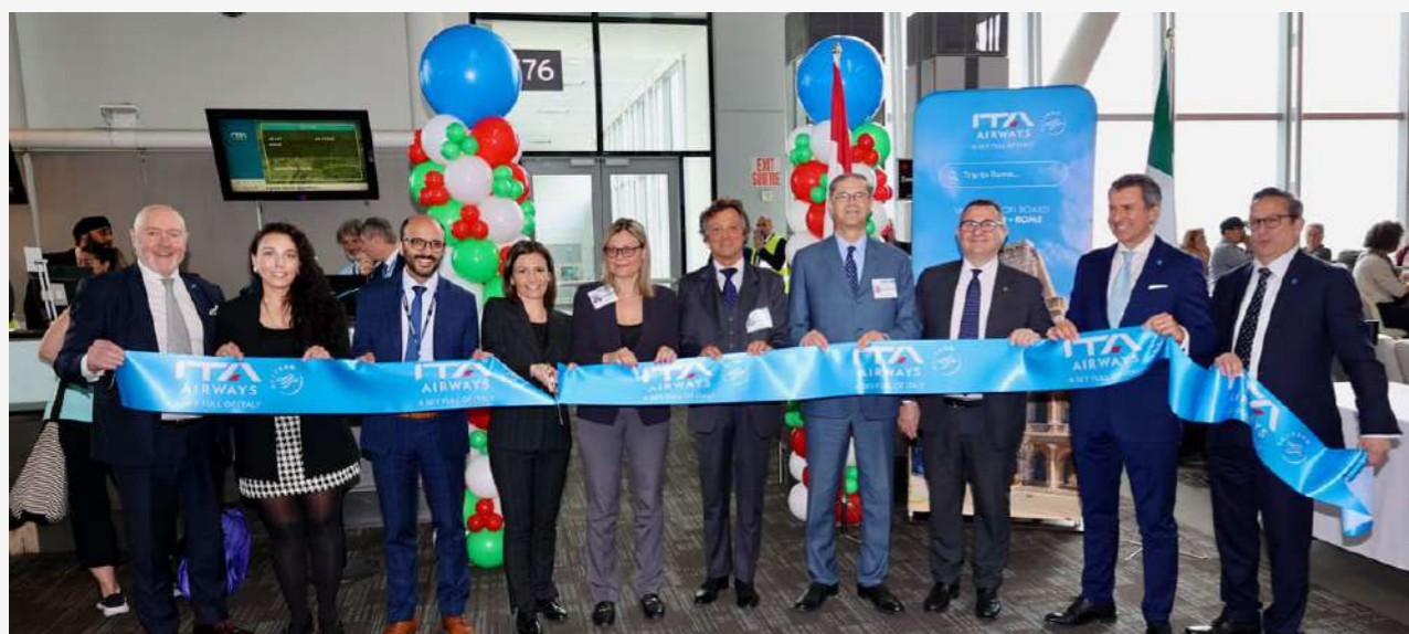
Pictured above: ITA Airways and partners celebrated the arrival of the airline's first flights from Rome in May.

ITA Airways has maintained a bumper Canada schedule since its debut in May. The airline's new Rome Fiumicino - Toronto service creates exciting new possibilities for travel beyond both cities.