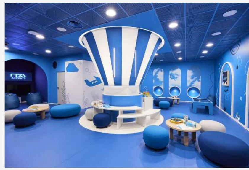
Pictured: ITA Airways' Fantasia children's lounge at Rome Fiumicino Airport